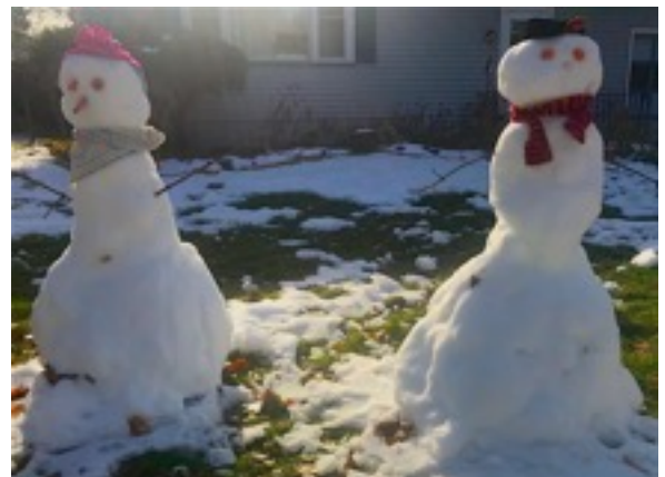
The first snowmen of the season

Their annual holiday cookie contest will be Sat Dec 15. Try your hand at winning.