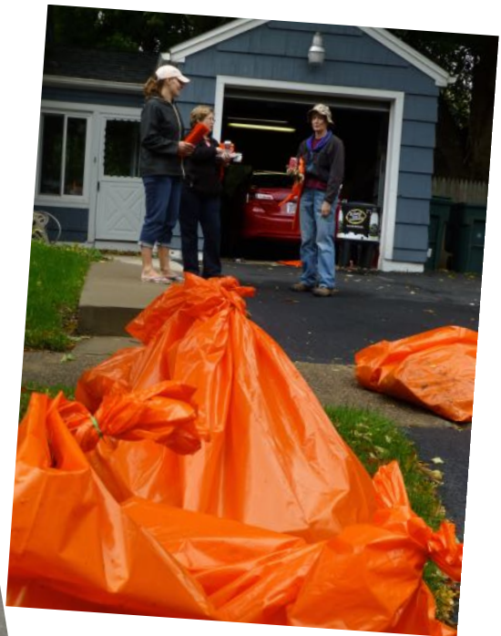
....just some of the bags!