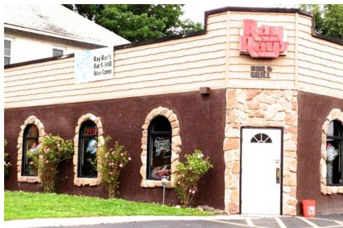
The new kid on the block!