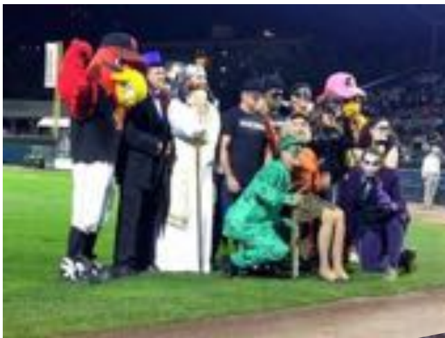
The Batman cast