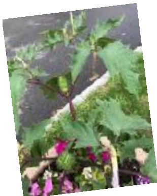
Thorn Apple Plant

Edit.....in person meetings will NOT be happening in Sept.