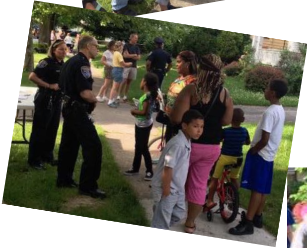
Lots of neighbors