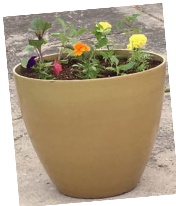
The finished product in one of our new pots!