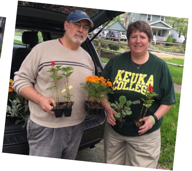
Just getting started!