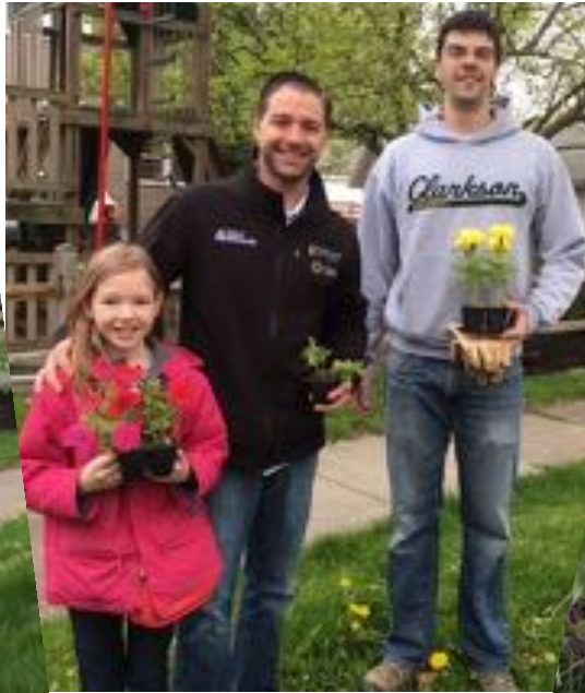
Lots of families!