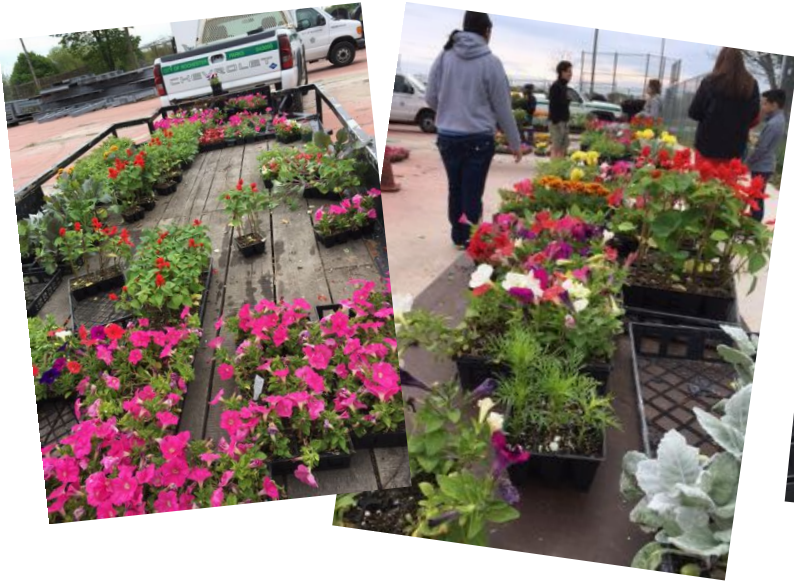
At the City pick up site