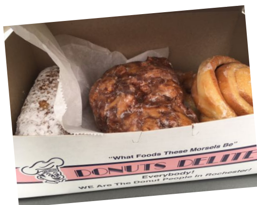
Hey, you didn't tell me there would be donuts!