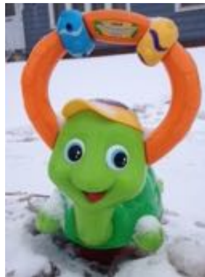
Seen on one of our streets!

The 50/50 raffle was again won by Peg who gave back all but her investment. Like last month, she plans on "reinvesting" her $1 next month. Thanks Peg!