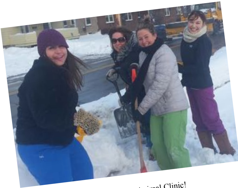
Thanks Rochester Animal Clinic!