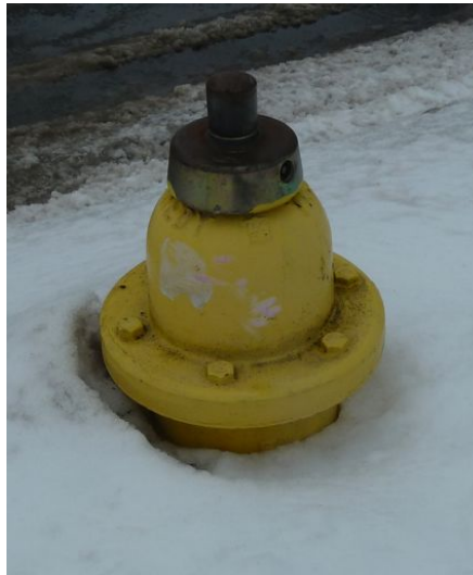
This one could use some help!