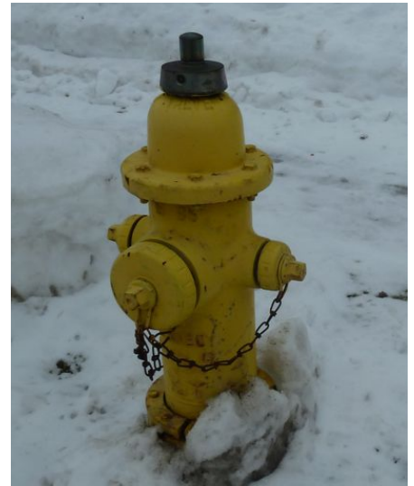
An adopted fire hydrant!

Winter is not over yet so please consider adopting a fire hydrant near you during the next snow storm. You might be glad you did someday!