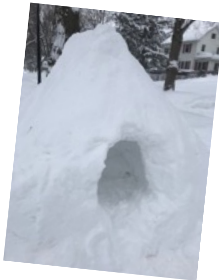
Igloo or hidden bus stop?

Do your kids want to play sports but not sure which ones? On Saturday, Feb 9, 1-4pm at the Main St Armory there will be workshops and demonstrations to help them decide along with vendors, clinics, raffles, prizes, and refreshments. Find out about sports programs and services for youth and meet coaches from RSCD.