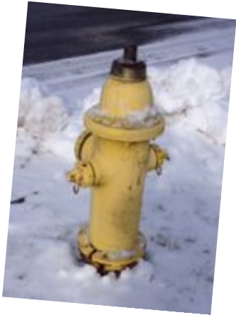
a happy fire hydrant!