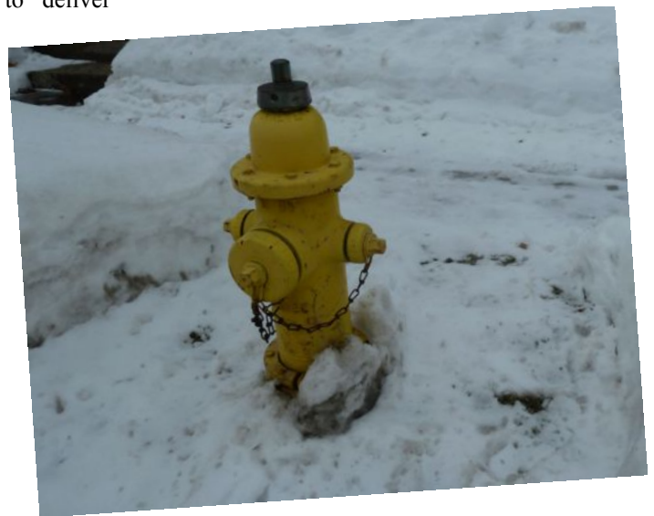
.....a very happy hydrant!